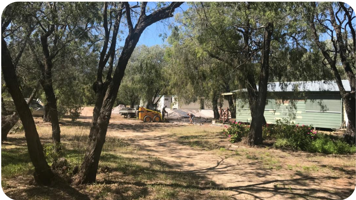
The Family Reunification Centre in Busselton under construction.

Fresh Start has acquired a long-term lease of acreage on the coast between Busselton and Dunsborough with a view to developing a respite and reunification centre for families in recovery from addiction. The first four years saw very slow progress as we sought local help with funding for the project but there have been encouraging steps taken in the past year. A number of buildings have been established on the property with power, water and sewage connected. Substantial financial support has been generously committed and it is anticipated that the centre will be ready for occupancy in 2021.